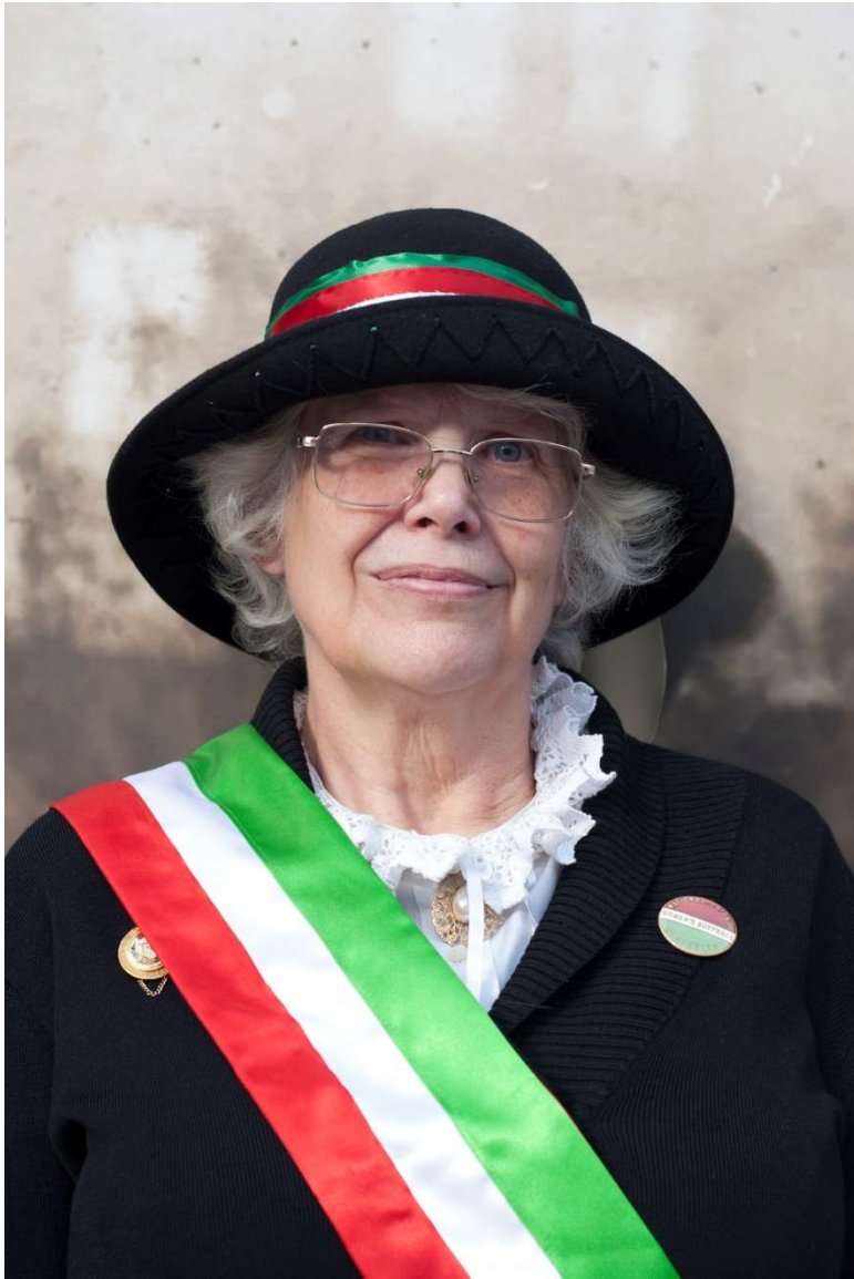
TG Honorary National Treasurer at New Street Station